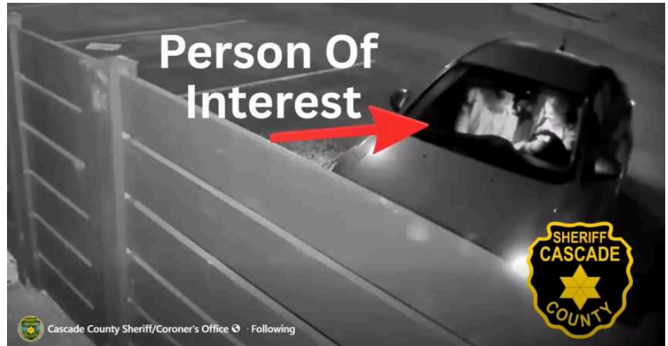
Screen capture from video provided by CCSO

Stay tuned to The Great Falls Gazette as we will update when more information becomes available.