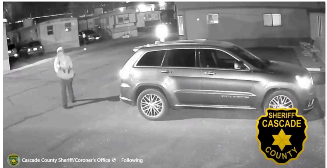
Screen capture from video provided by CCSO